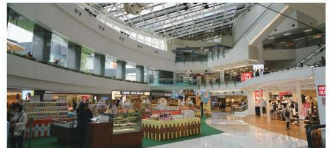
Metropiazza - A renowned and fashionable landmark for shopping