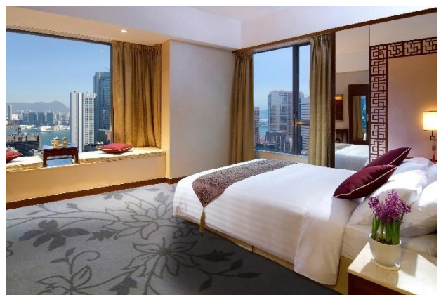
Deluxe Harbour View Room