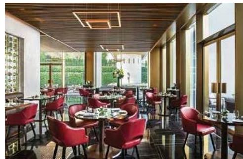
The Tai Pan