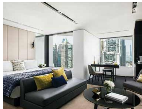
N3 Grand Deluxe